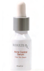
Problem Skin Serum